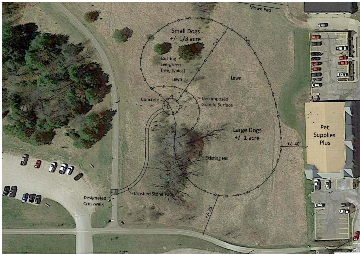
PROJECT SKETCH: Site will be Survey and staked prior to Contract Work by Others